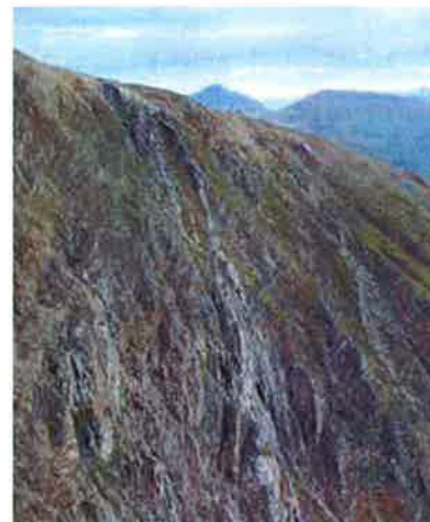
Little Nahanni pegmatites in the Mackenzie Mountains

The demand for supplies of lithium was expected to grow by some eight percent annually in 2014. However, with the creation of mega lithium-ion battery factories, analysts believe demand will double.